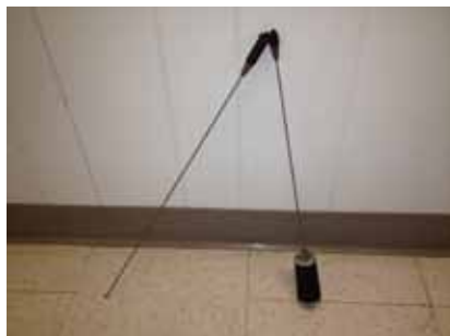
My Previous Antenna

In mid November I found myself (VA6GC) needing a new dual band base antenna with high gain for use in Daysland, my hope was that Mrs. Clause would bring one all the way from the North Pole. I chose a Comet GP-9.