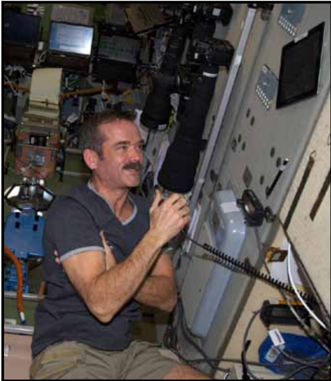
Hadfield during his HAM Radio session with the students of Charles P. Allen High School in Bedford, Nova Scotia.